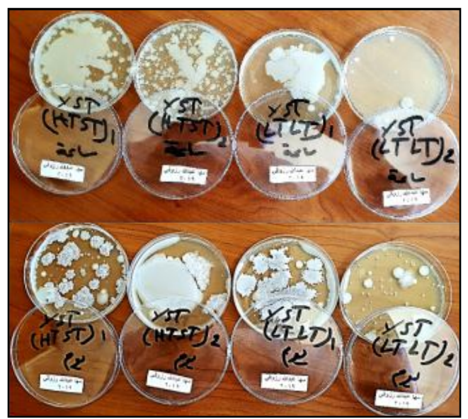
Fig. 1: Deciphering thermal processing (LTLT and HTST) of milk contaminated with C. albicans clones lineage.

organoleptic components throughout reducing contaminant microbial (opportunistic pathogens) load logs with their spoilage enzymes and toxins as well as, increase shelf life of food, i.e. extend lag phase of pathogenic