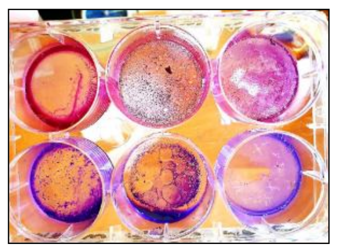
Fig. 3: Biofilm inhibition assay of C. albicans processed with peppermint extracts. From point of view cascaded right control, middle treated with alcoholic extract and left treated with watery extract.

of peppermint causing disruption in cell membrane & biofilm of C. albicans ending with apoptosis & death (Benzaid et al. , 2019). Combined hurdle processing regimes with thermal processing cascaded by peppermint were efficient for reducing and combating the denominator to the limits that not harmful while pasteurization regimes alone could reduce majority but not thermoduric strains.